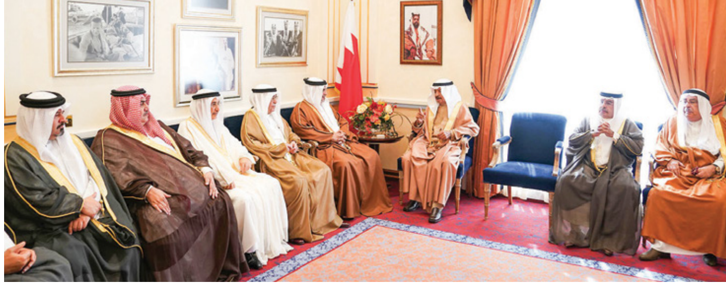
His Royal Highness Prime Minister Prince Khalifa bin Salman Al Khalifa yesterday received His Royal Highness Prince Salman bin Hamad Al Khalifa, Crown Prince, Deputy Supreme Commander and First Deputy Premier at Gudaibiya Palace. They stressed that Bahrain, under the leadership of His Majesty King Hamad bin Isa Al Khalifa, has been able to overcome many challenges. They added that thanks to the royal wisdom, the government's resolve and the people's determination, the kingdom is capable of going ahead on the path of development and changing challenges into motivating factors for achievement and excellence. They also expressed satisfaction at Bahrain's progress in various development fields, underlining the kingdom's advanced Arab and international status which is reflected by international indices.