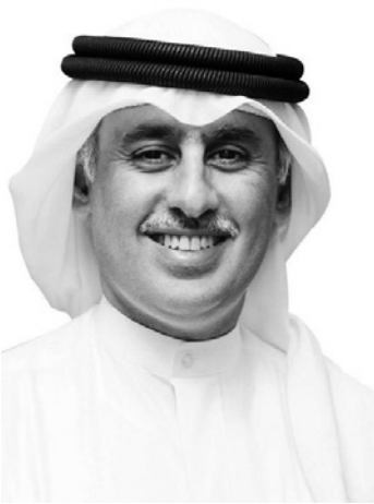
Zayed bin Rashid Al Zayani, Minister