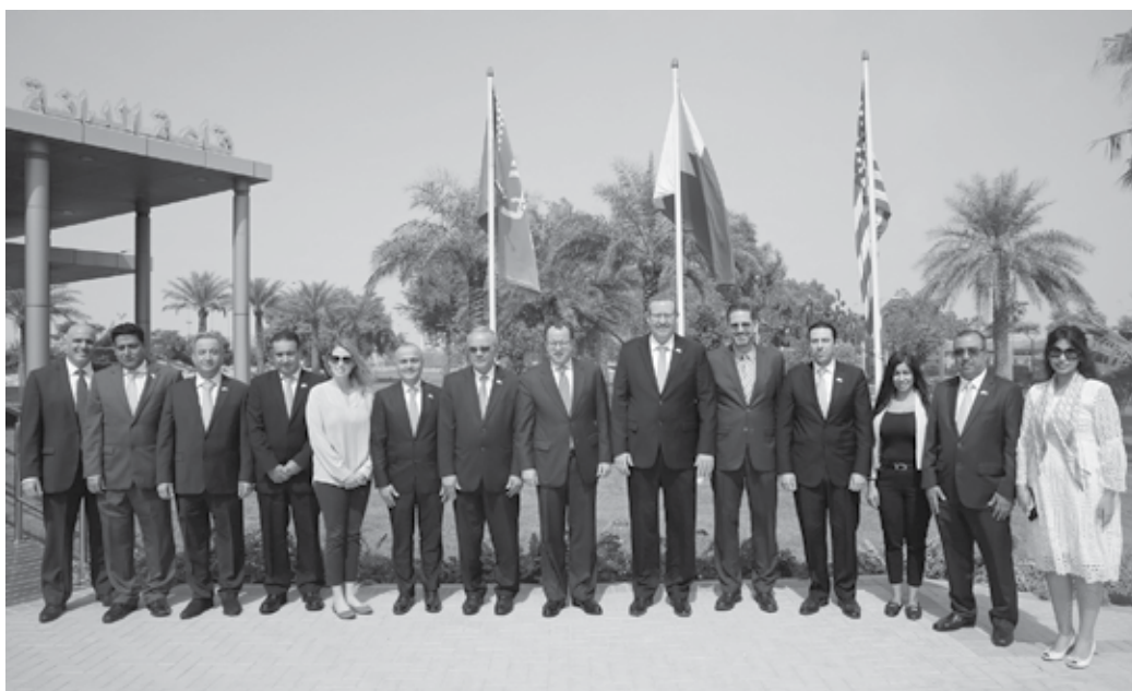
Justin Siberell, the US Ambassador to Bahrain with Alba CEO Tim Murray and other officials during a group photo session held during his visit yesterday to Aluminium Bahrain (Alba). The delegates were briefed on the progress of Alba's Line 6 Expansion Project which will achieve the First Hot Metal on 1 January 2019.