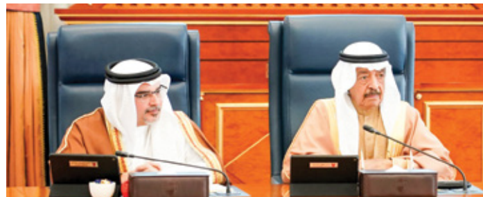
HRH the Premier chairs the Cabinet in the presence of HRH the Crown Prince.

The session welcomed the successful steps and firm decisions taken by the Saudi King to hold anyone who fails to carry out their duties accountable, and to deal with any mistakes or negligence credibly, transparently and