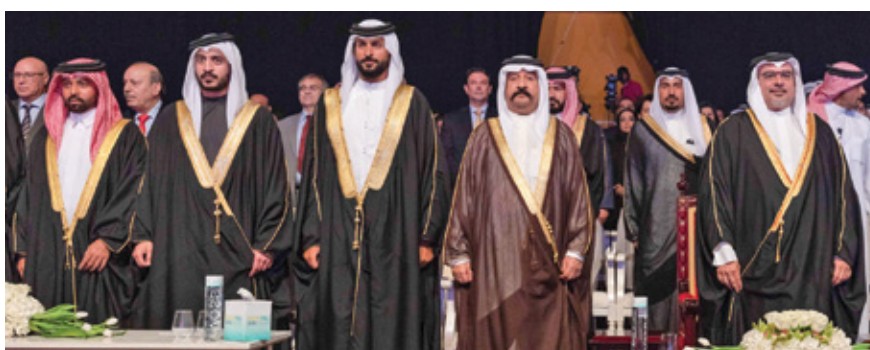
HRH the Crown Prince with HH Shaikh Nasser, HH Shaikh Khalid, Royal Family members and senior government officials at the inaugural ceremony.

The international festival, held under the patronage of HM the King and organised by the Ministry of Youth and Sport