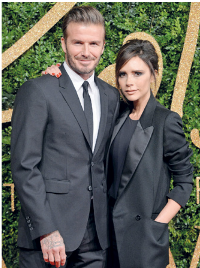
David and Victoria Beckham

"I've grown to kind of ignore some of the negative