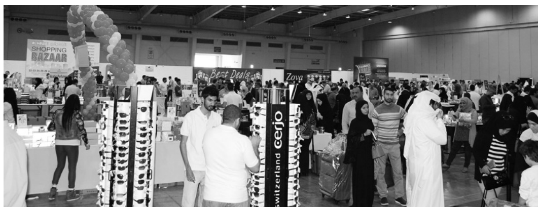
Shoppers at Al Hawaj shopping bazaar

Shoppers can feast their eyes on a wide array of fabulous brands in perfumes, cosmetics, watches, skincare, leather bags,