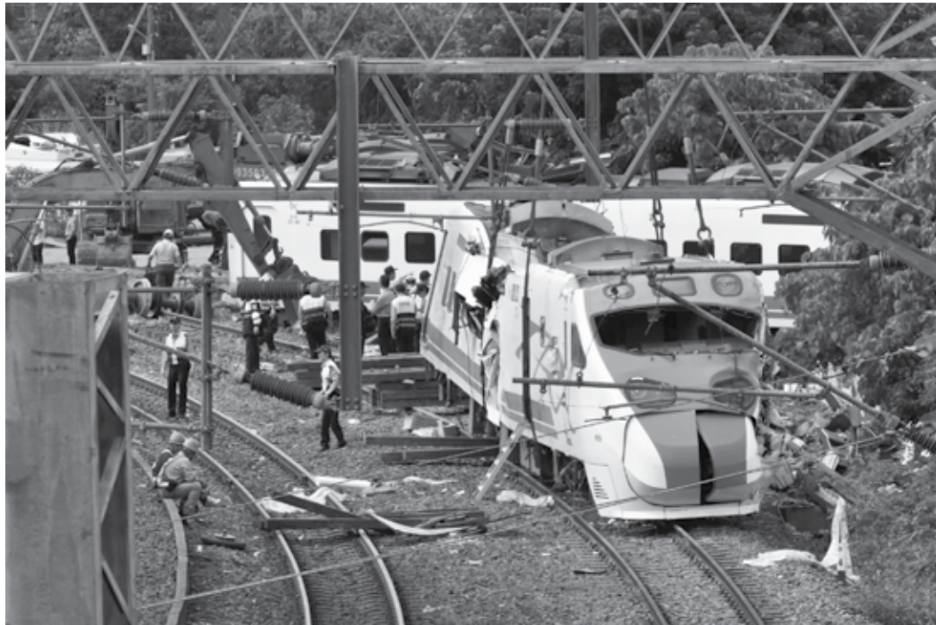
A general view shows the location where a Puyuma Express train derailed in Yilan, eastern Taiwan

A task force and forensic units will determine whether the derailment was "an accident or human error" prosecutor Chiang