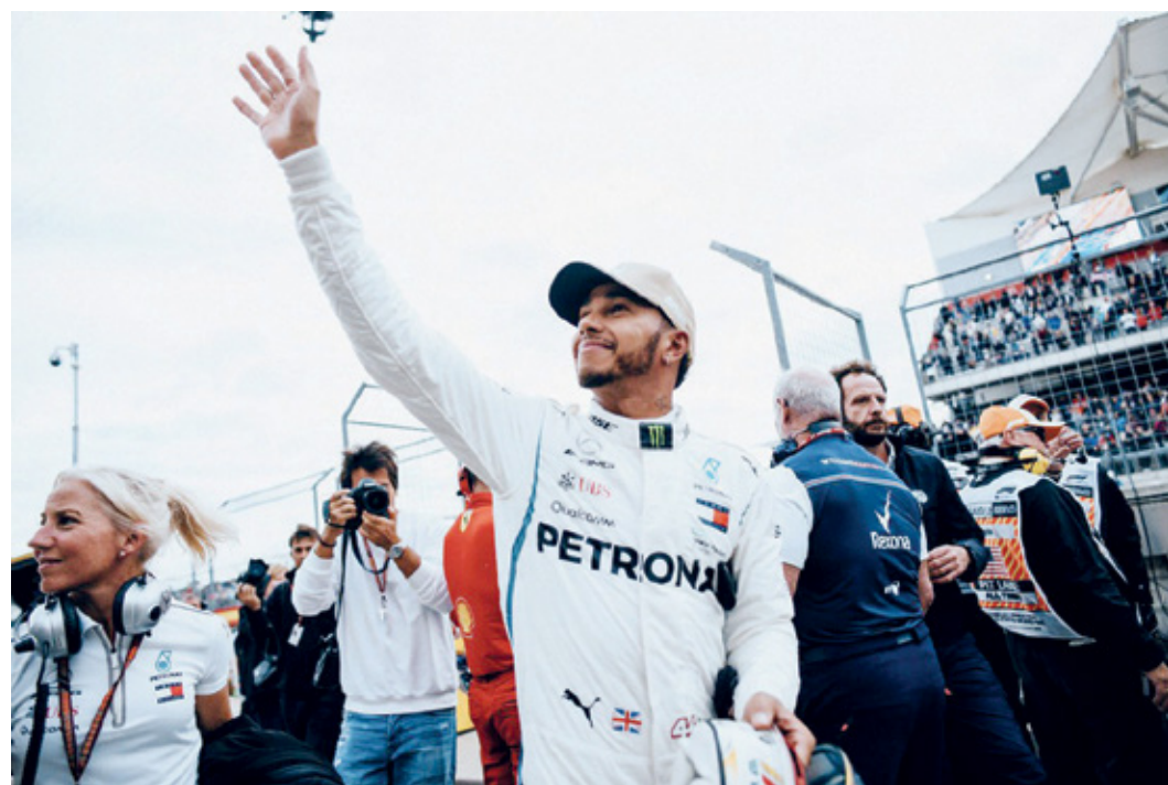
Mercedes' British driver Lewis Hamilton waves to fans during the United States Grand Prix

Lewis Hamilton finished third, but missed out on clinching his fifth drivers title as he was called in for an early pit-stop to take advantage of a Virtual Safety Car intervention on lap 11