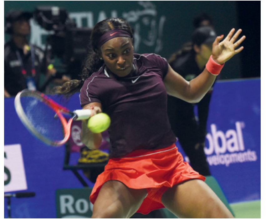
Sloane Stephens of the US hits a return against Japan's Naomi Osaka

“Obviously playing someone with a lot of confidence is always a tough task, but I think that I played well and