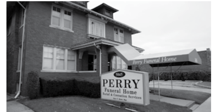
The Perry Funeral Home on Trumbull Avenue in Detroit