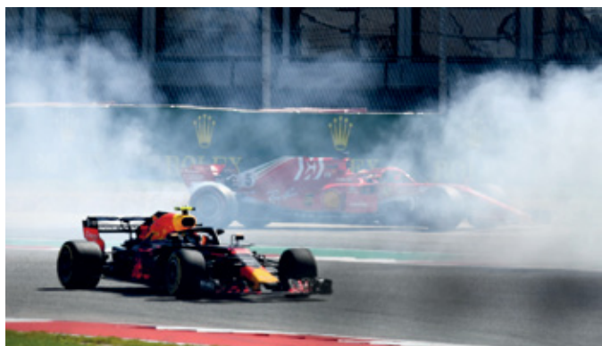
Sebastian Vettel spun off the track on the first lap after an incident with Daniel Ricciardo