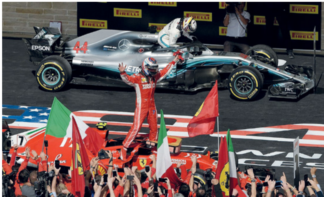
Lewis Hamilton climbs out of his Mercedes car as Kimi Raikkonen is congratulated by Ferrari fans

"I might be getting older, but it's not too bad still. Maybe I'm ok to be around a few years more.