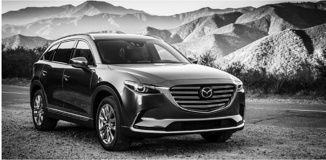
All-new CX-9 is Mazda's midsize three-row crossover SUV

Mazda has been carrying out several activities of brand value enhancement, involving all the distributors and dealers worldwide. "We are aiming to make Mazda a strong and unique brand which has a deep relationship with people who love cars that provide outstanding driving